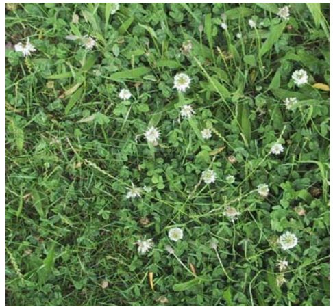
100% ground cover Pasture density = 350 kg DM/ha/cm