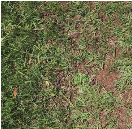
75% ground cover Pasture density = 200 kg DM/ha/cm