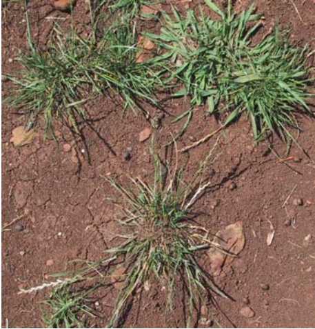
25% ground cover