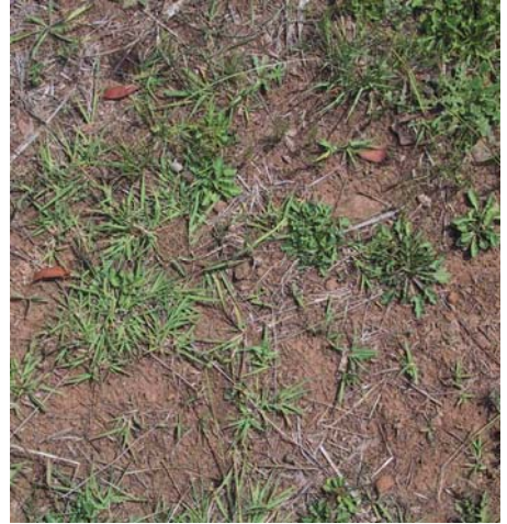
50% ground cover